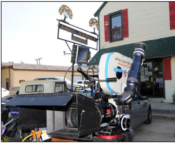
Lost Maples Cafe