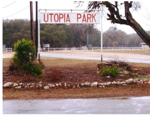
Rodeo & Dance Scenes at Utopia Park