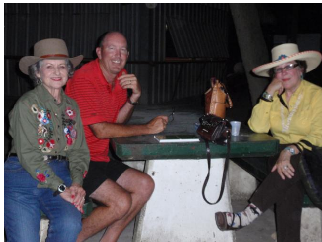
One of the Producers visits with ladies