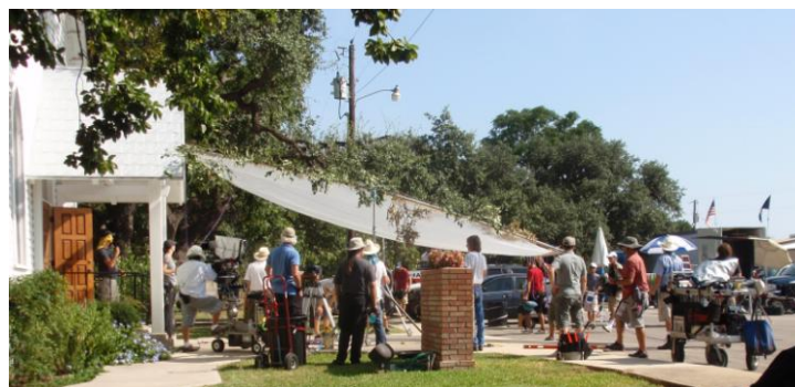
Utopia United Methodist Church renamed for movie – Utopia United Church