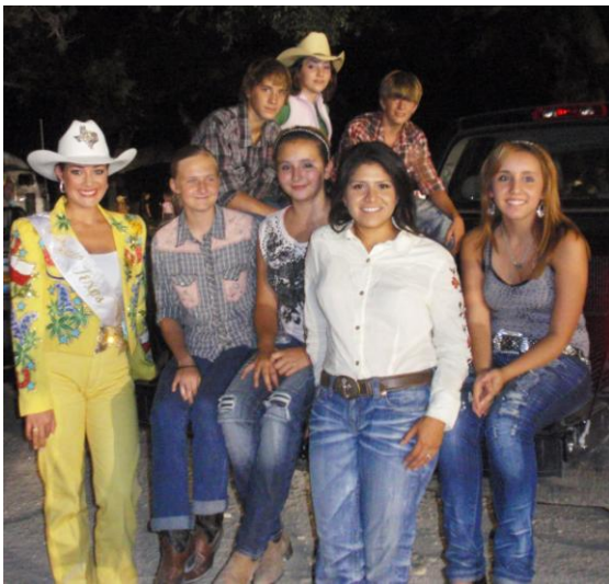
Miss Rodeo Texas with local youth